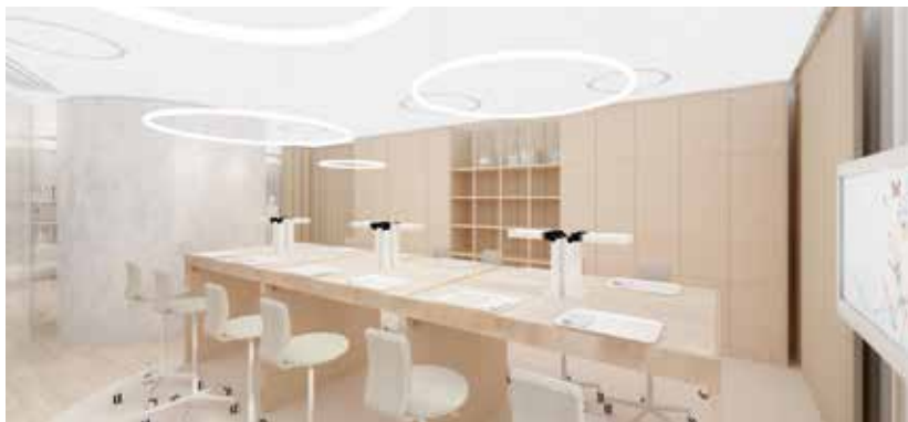
Gemology workshop L'ÉCOLE, School of Jewelry Arts, Hong Kong