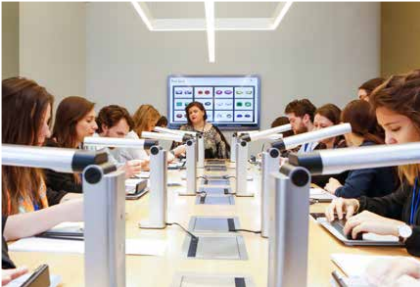
Gemology workshop L'ÉCOLE, School of Jewelry Arts, Paris

發掘鑽石的奧秘，包括其非凡特性、難以置信的由來，及無可匹敵的硬度，亦可嘗試以色澤為鑽石分級，和評定其淨度。