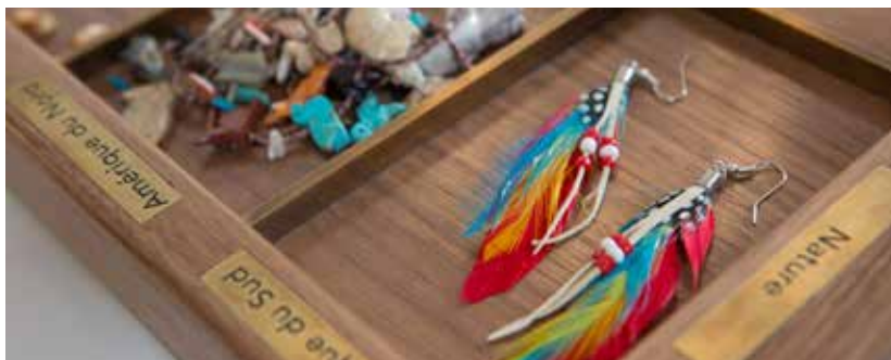
Amulets and Precious Symbols 護身符與珍貴象徵

Learn about the Maison's most legendary inventions and creations including the Mystery Set™, Zip necklace, Minaudière™ precious case and 'Poetic Theaters'.