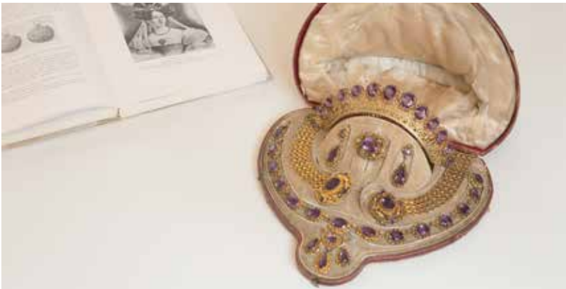
A History of Jewelry, from Louis XIV to Art Deco 一段珠寶歷史：路易十四至裝飾藝術時期

了解世家最傳奇的發明及珍品，包括隱密式鑲嵌(Mystery Set™)、Zip項鏈、Minaudière™珍貴百寶匣及「Poetic Theaters」詩意國度。