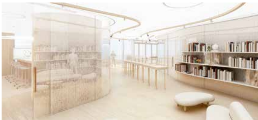
Library and exhibition space L'ÉCOLE, School of Jewelry Arts, Hong Kong