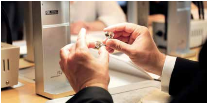
Discover the Gemstones 探索寶石的世界

Discover the secrets of this gemstone, from its uncommon properties and improbable birth to its unequalled hardness. Experiment classifying diamonds by color and assessing their clarity.