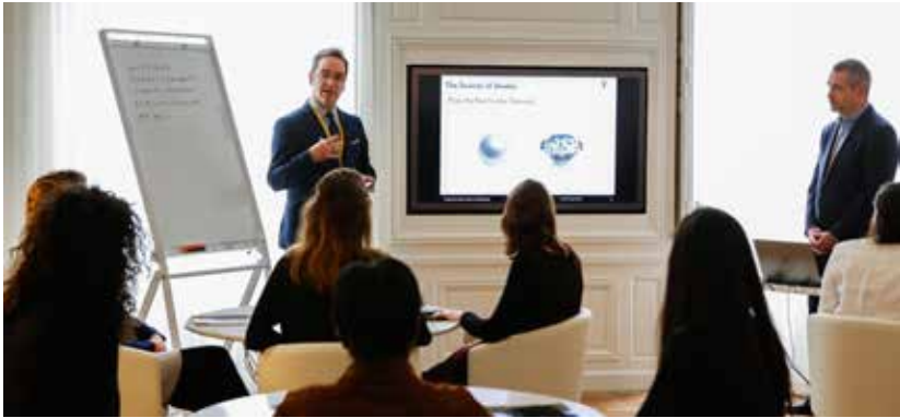
Art History of Jewelry 珠寶藝術史