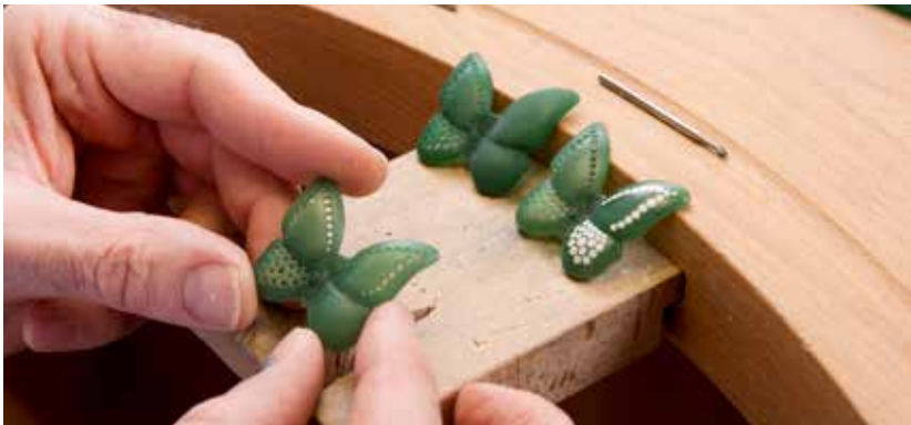
From the Wax Project to the Setting Techniques 從蠟模雕製到鑲嵌技術