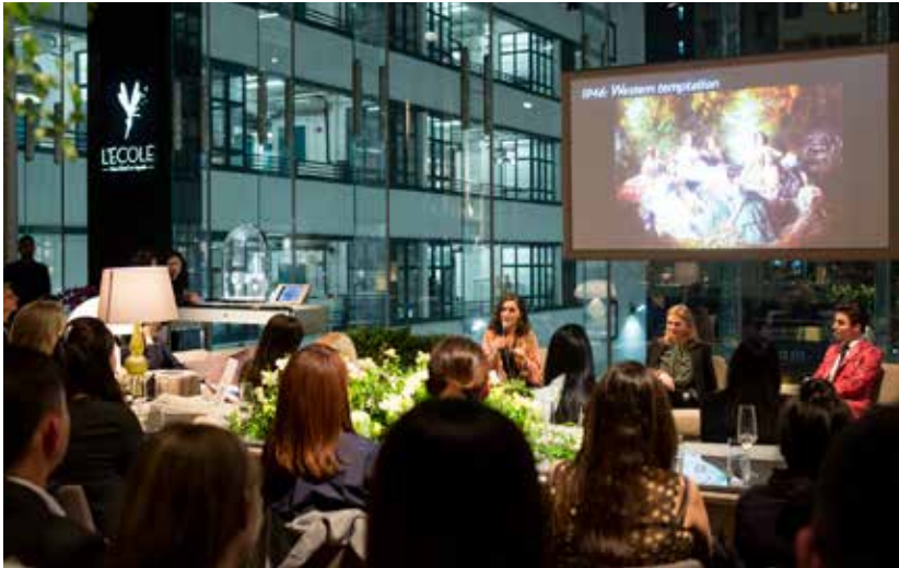
Evening Conversations 晚間講座對談

每場講座對談均由兩名專家帶領，從不同角度探索有關珠寶世界的特定主題。一場場盛會讓大家跟專家聚首一堂，上演你來我往的熱鬧互動。講座對談將於晚間舉行，由雞尾酒會揭開序幕。