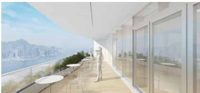
Terrace L'ÉCOLE, School of Jewelry Arts, Hong Kong