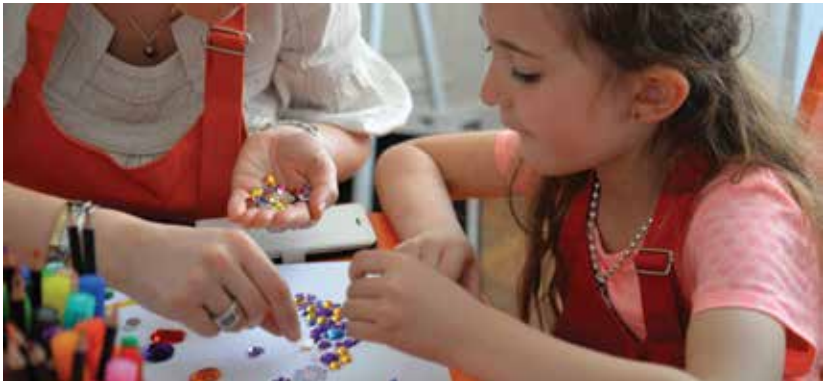
'Create Your Jewel' Workshop 「製作你的珠寶」工作坊

青少年則可透過鑑賞寶石，或坐上寶石匠的工作台，學習專業技巧，敞開寶石及珠寶世界的大門，了解箇中精髓。