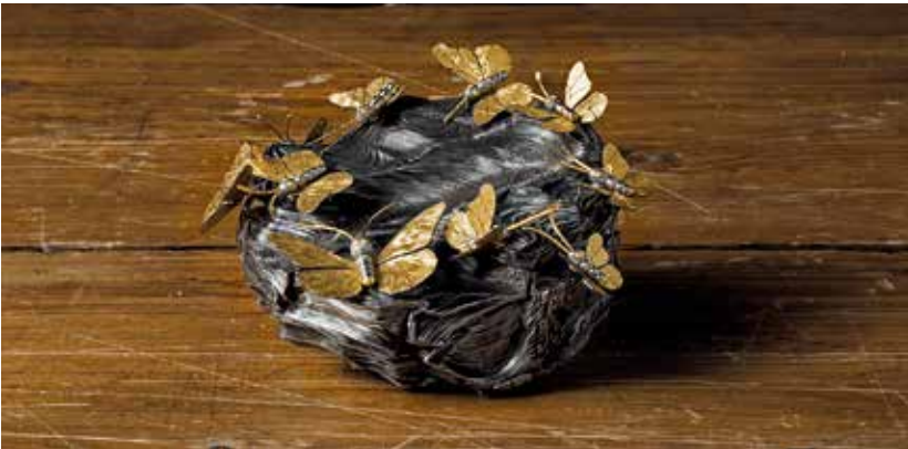
Ten Butterfly Box by Daniel Brush

L'ÉCOLE珠寶藝術學院亦提倡透過免費公眾展覽，提升公眾對珠寶的鑑賞能力。展覽與收藏家及當代藝術家合辦，提供難能可貴的機會，讓公眾一睹非凡的私人藝術珍藏，從中領會珠寶藝術的多元面貌。現場將設有導覽團，以及由藝術歷史學家、研究學者及其他專家親撰的展覽場刊。